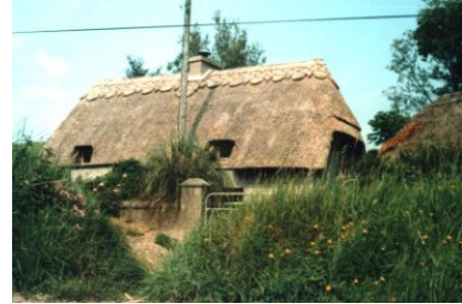
Thatch Cottage at Sweetmount, Bridgetown, Co. Wexford

Any advice or comments found on this site are used entirely at your own risk and discretion